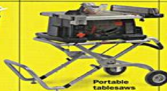
Portable table saws