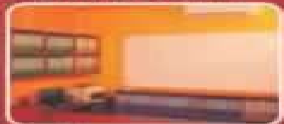
Learning facilities at Benchmark

Benchmark is focused on exceptional academic performance. Parents/Guardians are invited to arrange an appointment with the Director-Academic for an initial discussion.