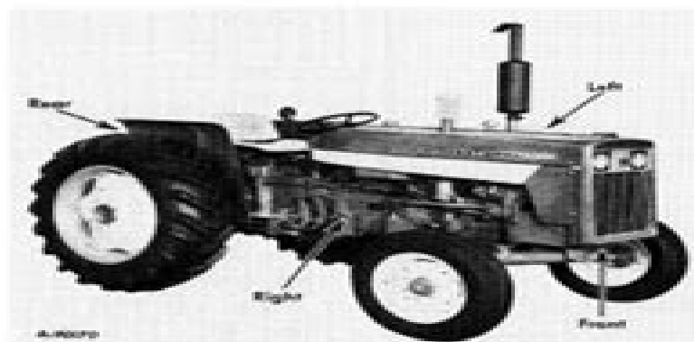
Illustr. 2A Terms of location.

The terms LEFT, RIGHT, FRONT, and REAR must be understood to avoid confusion when following instructions. LEFT and RIGHT indicate the left and right sides of the tractor when facing forward in the driver's seat. See Illustr. 2A.