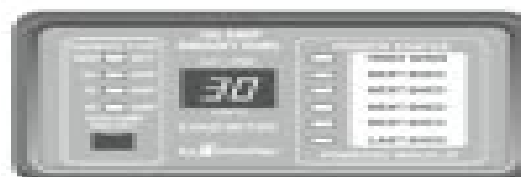
50 Amp EMS Display Panel P/N 00-00684-000