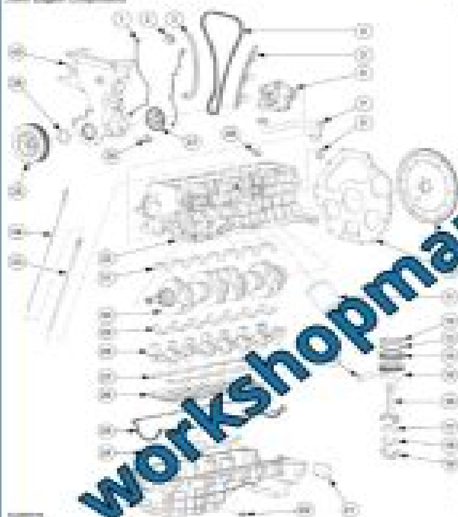
Joint Engine Components