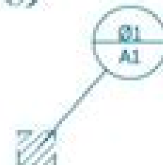
Target area (rectangle)