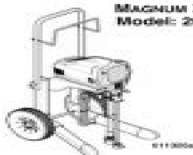
MAGNUM X7 Model: 262805