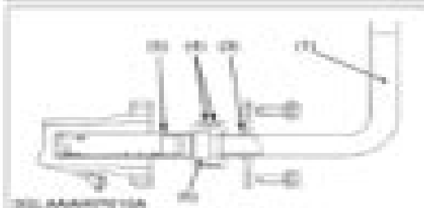
Oil Filler Dipstick