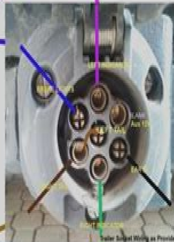
Trailer Socket Wiring as Provided