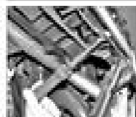
15.14 Tighten the water manifold bolts