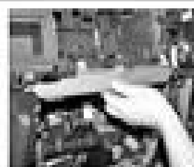
15.15 Remove the water manifold from the base