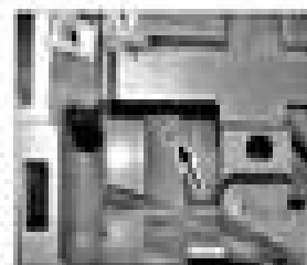
15.20 Tighten the fast retaining bolts, ensuring the fastening connecting control panel to the base