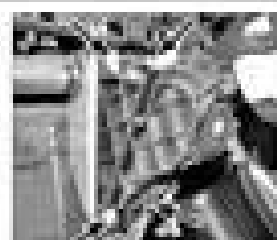
15.16 Tighten the fast retaining bolts (removed)