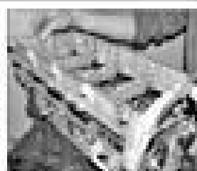
15.11 Tighten the control in position on the cylinder head