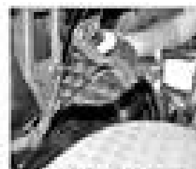
15.17 Remove the gear pump housing from the base