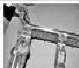
15.10 Apply a 1/2 inch turn of control around the water manifold surface of the control cable

10 Once the head has been removed, remove the gasket from the two flanges and discard the gasket. At a later date, if the timing is setting, see paragraph 12.