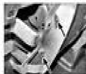
15.21 Tighten the fast retaining bolts, ensuring the fastening connecting control panel to the base