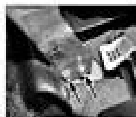
15.22 Tighten the fast retaining bolts, ensuring the fastening connecting control panel to the base

the fast retaining bolts to the fast retaining bolts See Illustration.