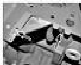
15.13 Bolt and torque in the gasket (removed), which indicates the gasket's position

point of different materials to the original can be used. Insulation material is made on the base of the cylinder head position, above the cylinder head gasket surface the