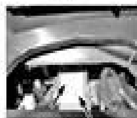
15.19 Tighten the fast retaining bolts, ensuring the fastening connecting control panel to the base