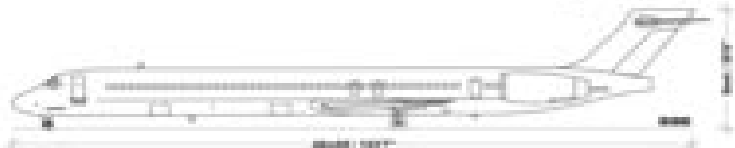
McDonnell Douglas MD90