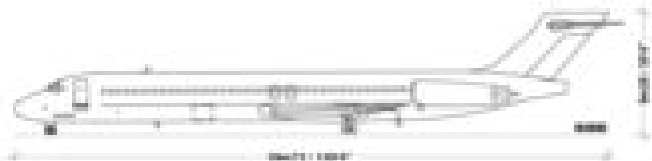
McDonnell Douglas MD87