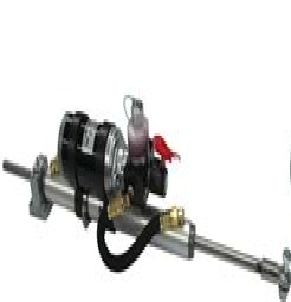
FLANGE MOUNTED STYLE