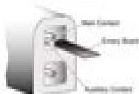
CLEANING AUXILIARY CONTACT