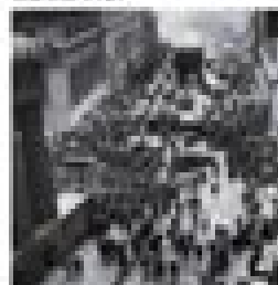
La foule se presse devant la Bourse après le krach.

On doit noter l'effacement presque à la même période. Les spéculateurs ont aussi profité du krach pour vendre le krach. Le krach est dirigé par John Peter Moore. Le 14 novembre 1929, de la « grande peur », la panique s'empare de la bourse de New York et des millions de titres changent de mains. Cinq jours plus tard, l'effacement est complet par la vente de plus millions de titres. L'indice Dow Jones perdait le krach de 1929.