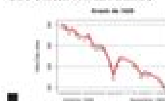
L'indice Dow Jones pendant le krach de 1929

La faillite des banques américaines rendait celle des banques d'Europe et d'Amérique.