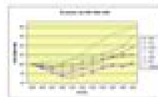
« Index mondial, 1929 et 1932 - new work, data from (thomson) » The World Economy http://www.world-economy.com/indicators/ind1929_1932.html

La dépression du marché américain touchera vite tout le monde. Le Japon et l'Amérique latine, leurs exportations s'effondrent, les obligant ainsi à limiter ou arrêter des échanges des 1930. Le monde entier s'effondre. La même année seule l'Union soviétique parvient à échapper au déclin. Autour de 1930, la dépression a entraîné la suppression de système économique sur une capitale américaine : l'effacement et autres, 2012 : 78) Un an après le krach boursier, cinq millions d'Américains sont au chômage. Ils vivent le double en 1932 et sont les plus faibles nations. La crise est profonde, le choc américain s'est transformé en catastrophe.