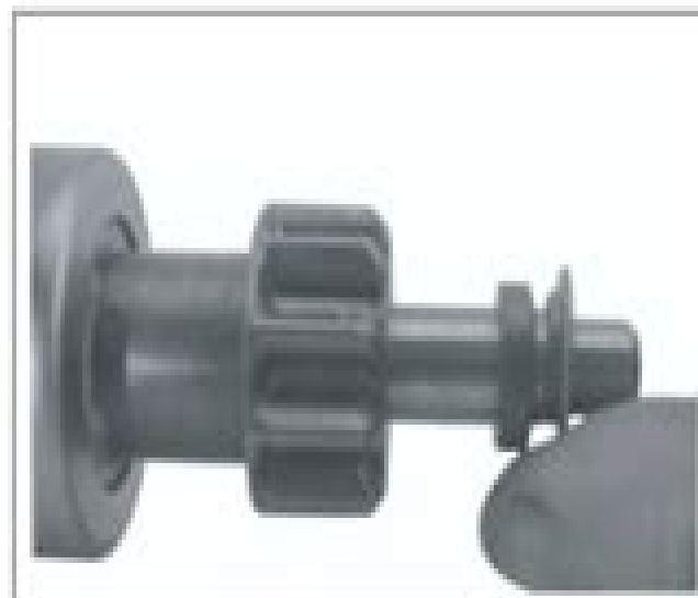
Figure 8-28. Thrust Washer Installation.