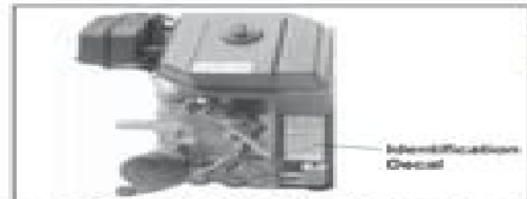
Figure 1-1. Engine Identification Decal Location.

The engine identification numbers appear on a decal, or decal, affixed to the engine structure. See Figure 1-1. An explanation of these numbers is shown in Figure 1-2.