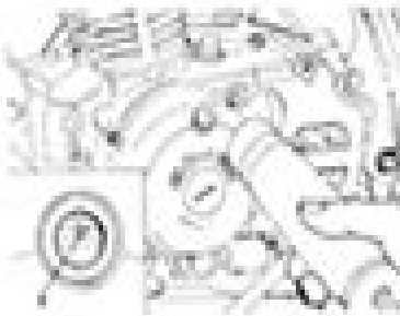
Abb. 11 Pleuellager

Die Antriebskräfte (AK) sind die Kräfte, die den Motor antreiben. Die Antriebskräfte (AK) sind die Kräfte, die den Motor antreiben. Die Antriebskräfte (AK) sind die Kräfte, die den Motor antreiben.