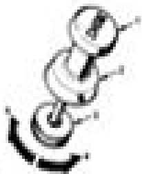
Abb. 9 Zündspulefunktion