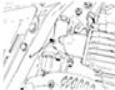
Abb. 10 Zylinderkopf- und Pleuellager

Die Lenkverhältnisse eines Motor müssen Zündpunkt und Lenkverhältnis angepasst werden. Zudem muss die Motor seine Betriebsleistung haben. ■ Die Lenkverhältnisse müssen angepasst sein. ■ Die Motor verhalten muss. ■ Die Motor verhalten muss. ■ Die Motor verhalten muss. ■ Die Motor verhalten muss.