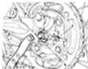
Abb. 12 Pleuellager