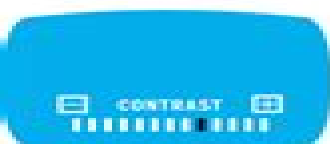
On-Screen Menu Display

FUNAI CORPORATION 100 North Street Teterboro, NJ 07606-1202