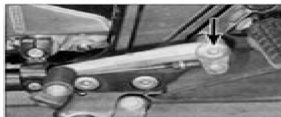
3.8 Remove the pivot bolt (arrowed) and remove the lever and linkage

8 Unscrew the pivot bolt securing the gearchange lever to the footrest bracket and remove the lever and linkage assembly (see illustration).