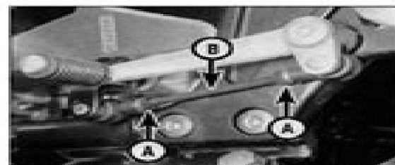
3.10b Slacken the locknuts (A) and turn the rod (B) to adjust lever height

7 On installation apply grease to the pivot bolt shank and tighten the bolt securely. Reconnect the sidestand spring and check that the return spring holds the stand securely up when not in use - an accident is almost