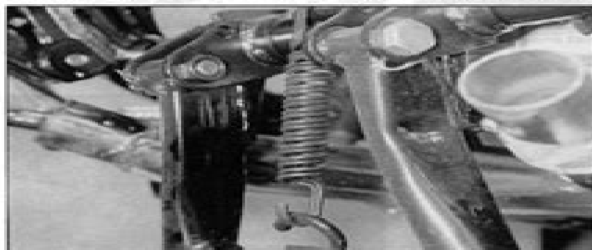
4.1 Unhook the stand spring, then unscrew the nuts and withdraw the bolts

1 Remove the screws securing both the left- and right-hand switch housings to the handlebar, noting how the top mating surfaces of the switch housings align with the top mating surfaces of the brake master cylinder and clutch lever assembly clamps, then separate the switch halves. Detach the throttle cables from the throttle pulley and note how the choke lever fits (see Chapter 3 if required), then remove the housings from the