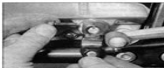
3.10a Align the previously made marks and install the pinch bolt

1 The centre stand is secured in the frame by two pivot bolts. Support the bike on its