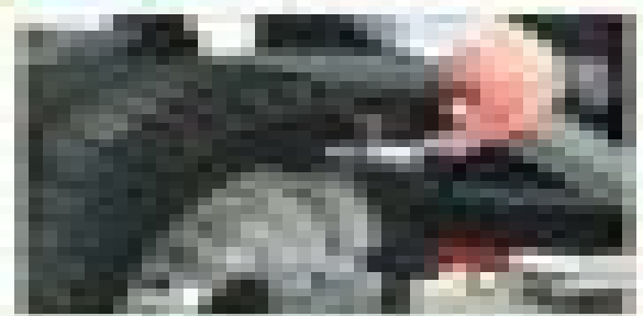
The control panel and monitor provide easy access to all functions.

H unter's new GSP6500 CRT balancer is a mid-range machine that offers QuickMatch™ match-mounting, a feature that allows for easy wheel changes. The machine is designed for use in a variety of applications, including automotive, industrial, and commercial. It features a large black wheel and a control panel with a monitor. The machine is mounted on a red base.