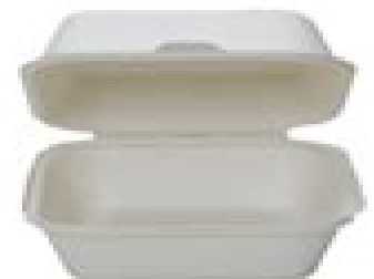
Take 1/2 To-Go