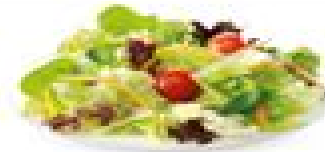
Salad As Appetizer