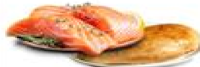
Lean Meat Or Fish