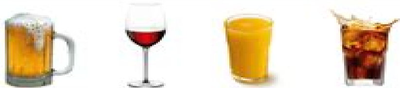
Alcohol & Sugary Drinks (Juice & Soda)