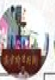
Oriental Pearl TV Tower