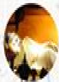
Shanghai Railway Station