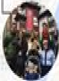
Shanghai Hongqiao Airport