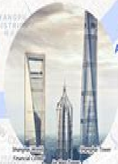
Shanghai Jin Mao Tower