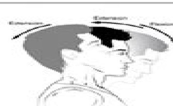
101 Angular movements: flexion and extension of the neck.