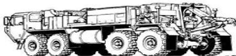
LEFT REAR VIEW