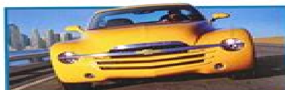
VALUE ANALYSIS 2003-'06 CHEVROLET SSR