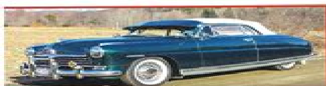
CLASSIC CAR PROFILE 1948-'54 HUDSON CONVERTIBLE