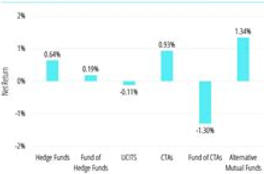
Fig. 1: Performance of Hedge Funds in Q3 2018 by Structure*