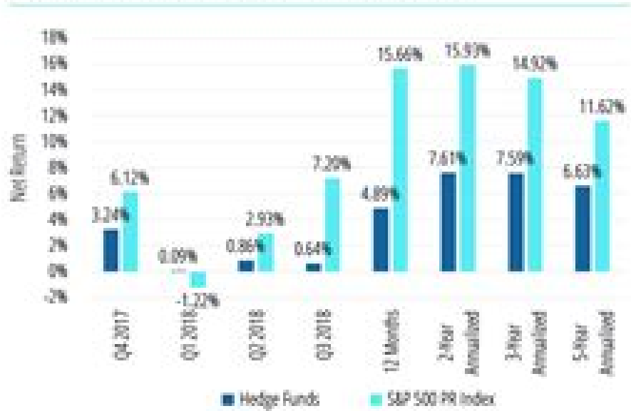
Fig. 2: Performance of Hedge Funds vs. S&P 500 PR Index*