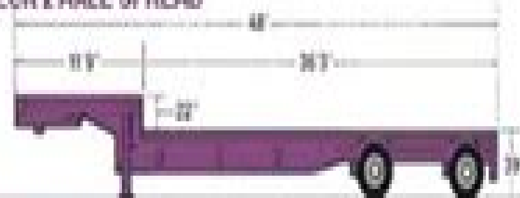
DROPDECK 2 AXLE SPREAD