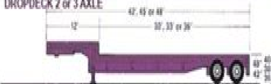
DROPDECK 2 or 3 AXLE