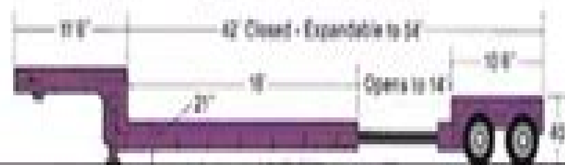
EXTENDIBLE (STRETCH) DOUBLE DROPDECK