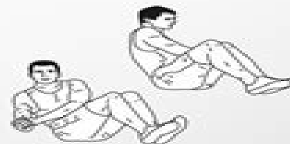
6. sitting twists