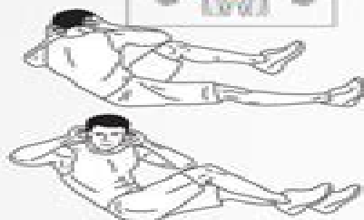
1. knee-to-elbow crunches