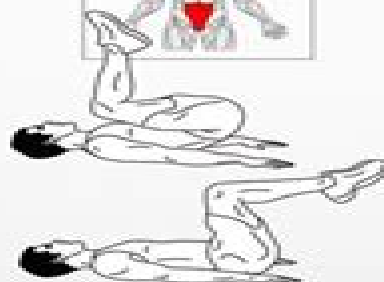
5. reverse crunches