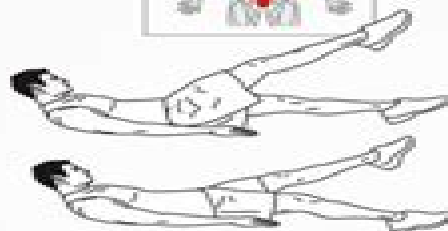
2. flutter kicks