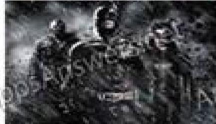
THE DARK KNIGHT RISES