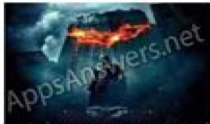
THE DARK KNIGHT