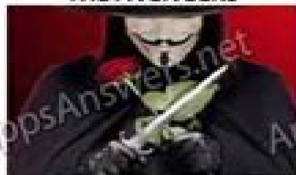
V FOR VENDETTA