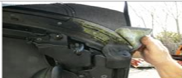
Step 25: FRONT CORNER FLAPS. Apply contact cement by spray to top front corner flaps and frame.