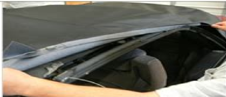
Step 23: INSERT SIDE CABLES Insert side cables from front of top side pockets and screw in back end with spring to frame.