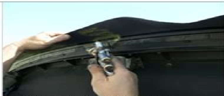
Step 27: APPLY CONTACT CEMENT Apply contact cement across top and frame.