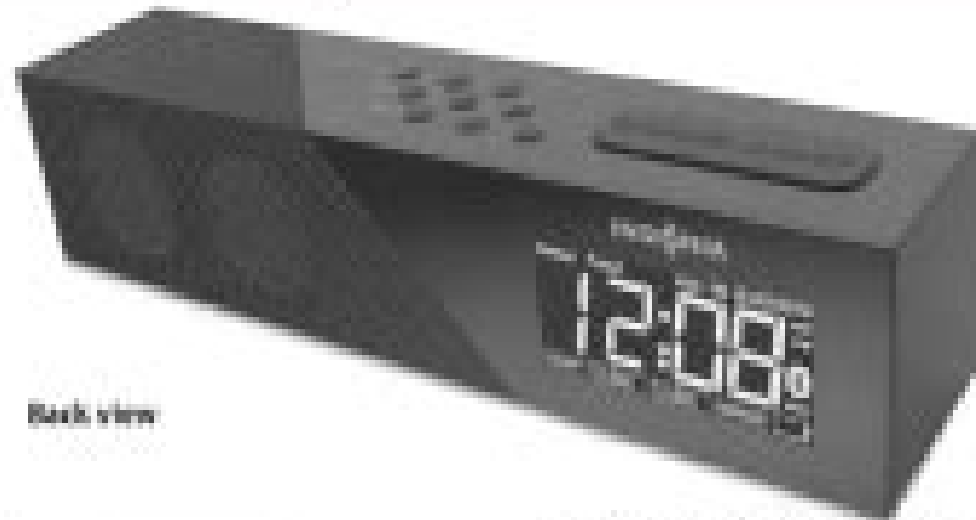
The diagram illustrates the layout of the alarm clock's control panel. It includes the following components and labels: Top Row (Left to Right): Set Alarm: Points to the 'Set Alarm' button. Alarm On/Off: Points to the 'Alarm On/Off' button. Alarm Volume: Points to the 'Alarm Volume' button. Alarm Tone: Points to the 'Alarm Tone' button. Alarm I: Points to the 'Alarm I' button. Alarm/Timer: Points to the 'Alarm/Timer' button. Second Row (Left to Right): Alarm Volume: Points to the 'Alarm Volume' button. Alarm On/Off: Points to the 'Alarm On/Off' button. Alarm Tone: Points to the 'Alarm Tone' button. Alarm I: Points to the 'Alarm I' button. Alarm/Timer: Points to the 'Alarm/Timer' button. Third Row (Left to Right): Alarm On/Off: Points to the 'Alarm On/Off' button. Alarm Volume: Points to the 'Alarm Volume' button. Alarm Tone: Points to the 'Alarm Tone' button. Alarm I: Points to the 'Alarm I' button. Alarm/Timer: Points to the 'Alarm/Timer' button. Bottom Row (Left to Right): Alarm On/Off: Points to the 'Alarm On/Off' button. Alarm Volume: Points to the 'Alarm Volume' button. Alarm Tone: Points to the 'Alarm Tone' button. Alarm I: Points to the 'Alarm I' button. Alarm/Timer: Points to the 'Alarm/Timer' button. Right Side: Alarm/Timer: Points to the 'Alarm/Timer' button. SNOOZE / DIMMER: Points to the 'SNOOZE / DIMMER' button.

• Digital Clock Radio with Bluetooth • AC/DC Adapter • Car & Bridge Mode • Filter Mode