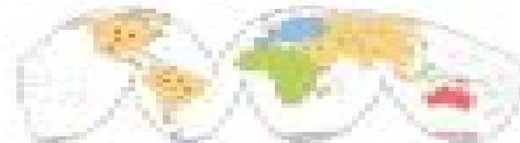
2. Goode's Equal-Area