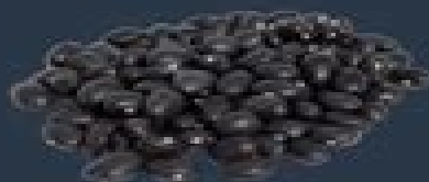
BLACK BEANS 18g