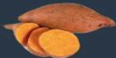
SWEET POTATO 23g