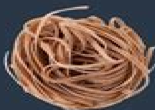
WHEAT PASTA 22g