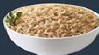
BROWN RICE 20g