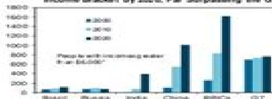
Millions in the BRICs to Enter Middle Class Income Bracket by 2020, Far Surpassing the G2

We've generally defined Middle Class as those with incomes >$6,000 and <$30,000 (US). To compare BRICs to the G2, we industrialized markers for all people >$6,000 - i.e. both the middle and upper class.