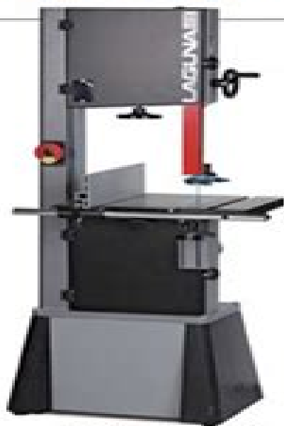
14-in. Bandsaws, p. 66