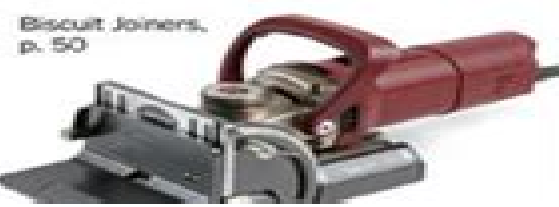
Biscuit Joiners, p. 50