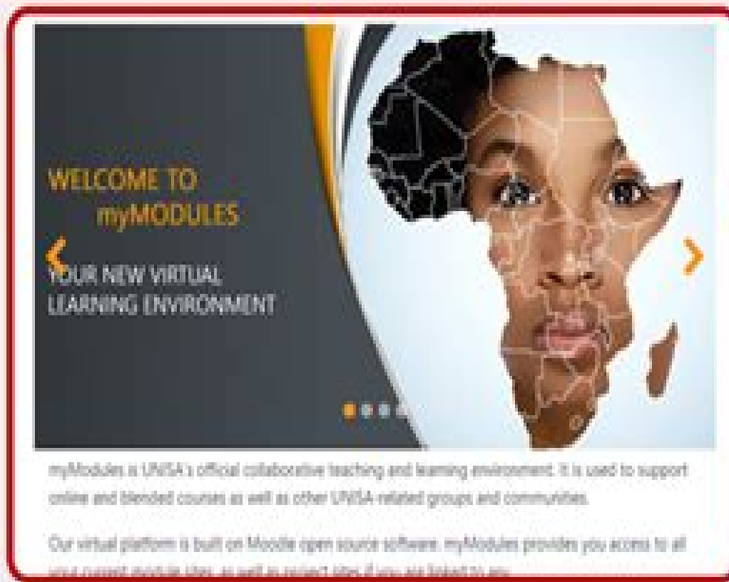
Main content area.