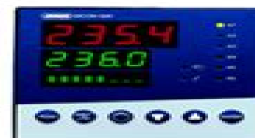
JUMO DICON 500 Type 703570/0...