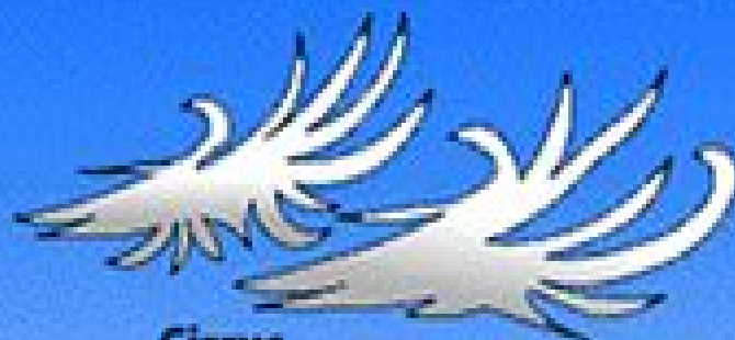
Cirrus above 18,000 feet