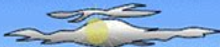
Altostratus 6,000-20,000 feet