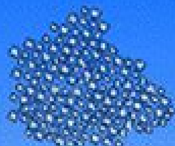
Cirrocumulus (mackerel sky) above 18,000 feet