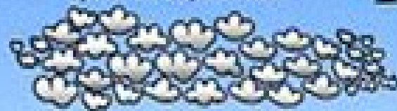
Altocumulus 6,000 to 20,000 feet