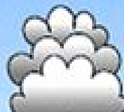
Cumulus below 6,000 feet