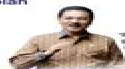
"PILIHAN SMA N 2 SUMBAR sebagai tempat belajar, memudahkan alumnus melanjutkan jenjang pendidikan kea berkeadilan" MENDAGRI Periode 2009-2014 Dr.H. Gamawan Fauzi, SH,MM.