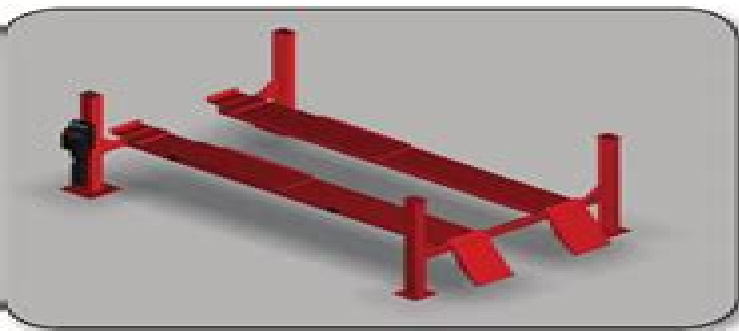
L451 Open Front 4 Post Lift