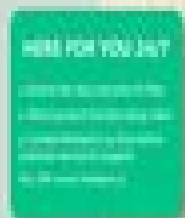
After sale card