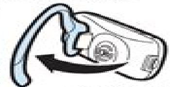
1 Open Earhook