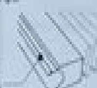
LOCK EDGE SIDE OF SIDE CURTAIN