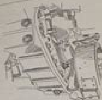
Transfer Case Drain and Filler Plugs. Fig. 164.

TRANSFER CASE —Drain, flush and refill every 5,000 miles. Drain in a similar fashion as described in the preceding paragraph. Refill to level of filler plug using lubricant specified in chart on Page 126. The location of the drain and filler plugs is shown in Fig. 164. Transfer case capacity 2 pints.