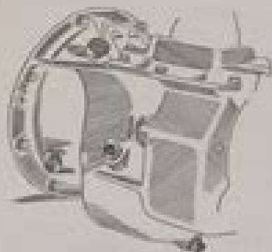
Transmission Drain and Filler Plugs. Fig. 163.

TRANSMISSION —Drain, flush and refill each 5,000 miles. This operation and other similar ones described below should, preferably, be carried out after a period of operation so the lubricant will be warm and completely fluid. Clean off dirt around drain and filler plugs, Fig. 163, then remove plugs with \frac{1}{8} " open end wrench and allow old lubricant to drain out.