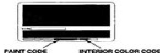
Vehicle Identification Number and Canadian Motor Vehicle Safety Standard Certification and Paint Code Label.