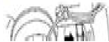
Fig. 1A Engine number (volume 1.4)

Verification and engine number stamped on the left side of the engine, the crankcase Fig. 1A.1A 1.1.1A .