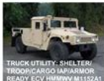
M1152A1 (LIN T37588)

M1152A1 replaces M1037, M1097, M1113, and most M998, M1038