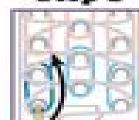
Grab the blue band on the left pin