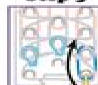
Grab the blue band on the right pin