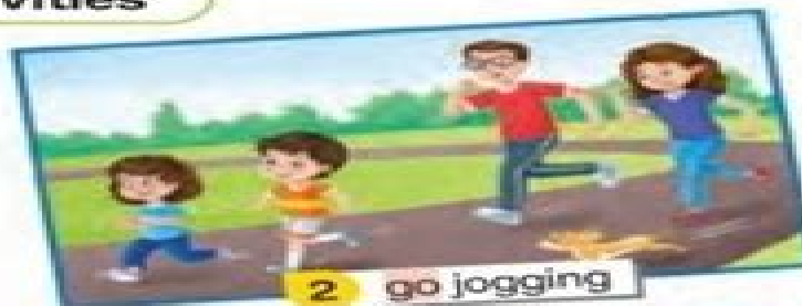
2 go jogging