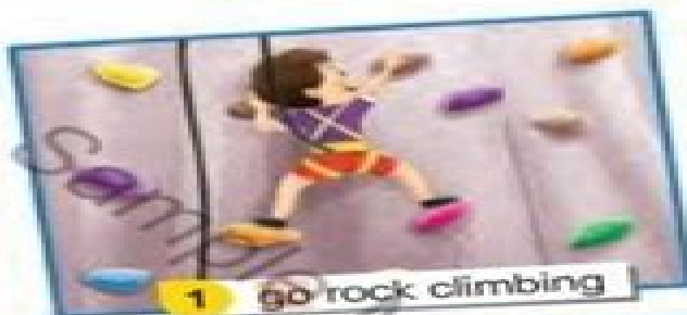
1 go rock climbing