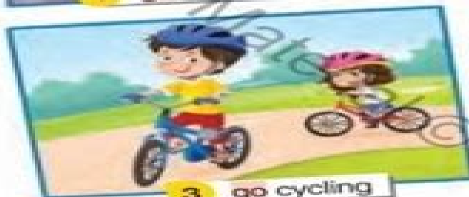
3 go cycling