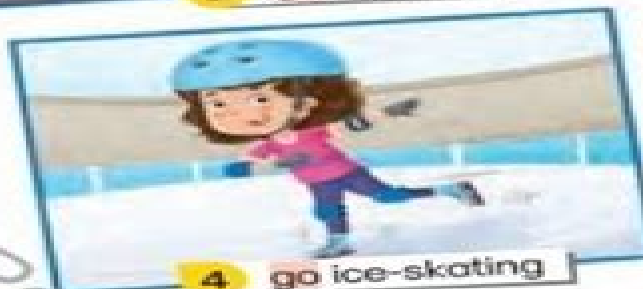
4 go ice-skating