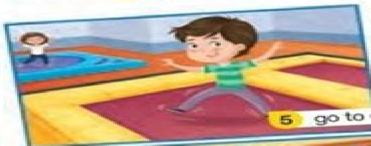
5 go to an indoor playground