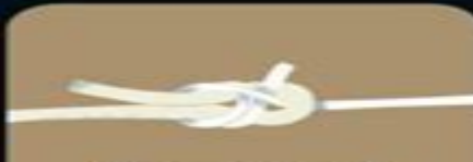
Sheet Bend Double