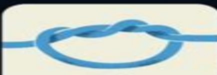
Double Overhand Knot