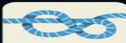
Figure Eight Knot